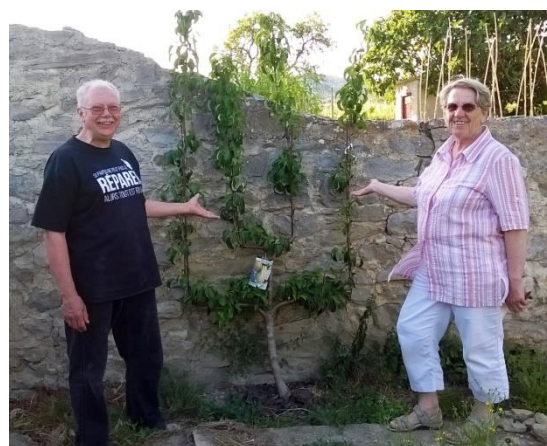
The Peace peer-tree offered by SERVAS international